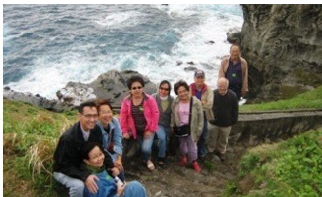
Part of the coast was sheer volcanic rock terminating into the sea, while others, like our resort area, was sandy shore and coral reefs.

The stretch limo jeepney that had a powerful Isuzu engine, and a very careful driver. On two occasions, the destination was a turn off from the main road, terminating in a dead end too tight for maneuvering the vehicle around. So Rufu backed up all the way; at one place it must have been for about half a kilometer, on a narrow winding road. There were a bunch of cows that overtook us.