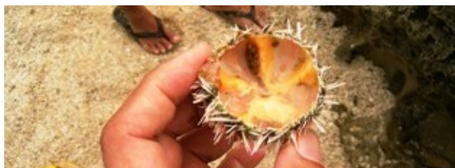
A new gustatory adventure: sea urchin cracked open, innards scooped up, and the remaining roe spooned out, to eat raw or with some lemon and vinegar. Ummm, delicious.