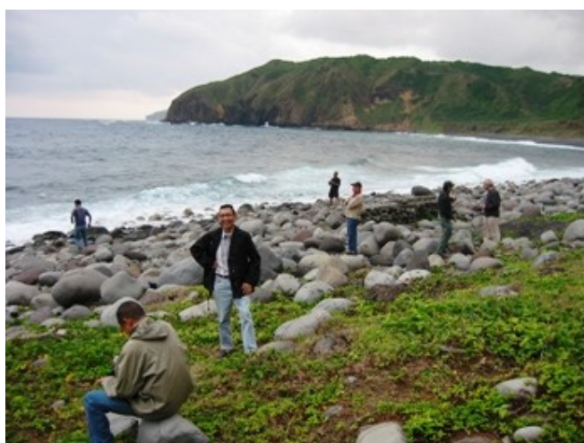
At one of the more rocky shores. No swimming here for sure.

We didn't explore the tunnel; only three of us ventured into the anteroom. In contrast, the lighthouse near town, though built in the last century, now obsolete, was all spruced up, and climable, all 53 steps to the top, which half of us managed to do. A restaurant was being constructed nearby.