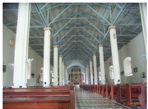
Photo on right is the inside of Bacarra church. The roof obviously is not original. I am reserving this shot for my Tanjay friends who presently are in a fight with the new, local priest who started demolishing the church pillars as an improvement.