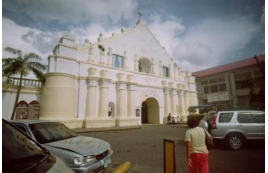
The Laoag bell tower is separated from the main church by a street. The church exterior has been modernized but the basic structure remains intact. Foundation was laid in 1612. See plaque below, right.