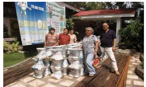
But first, another toilet pose.