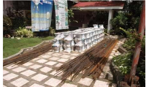
The remaining toilets and steel bars in the front yard of the clinic.