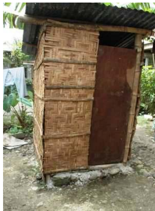
All closed up.