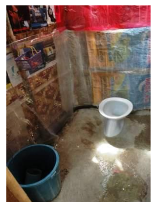
Up close inside.