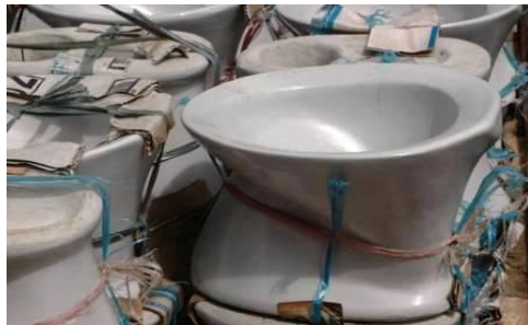
Object of the exercise, water-seal type.