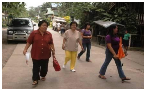
Walking with staffers to the nearest installation a few blocks away.