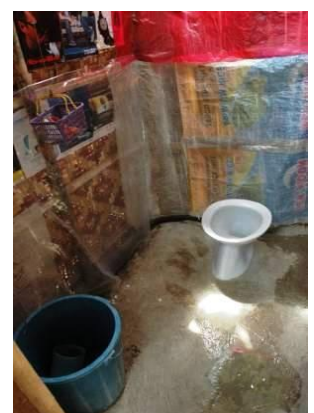
Up close inside.