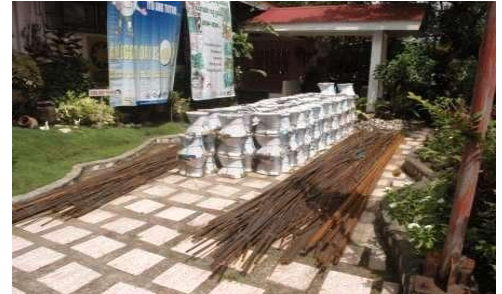
The remaining toilets and steel bars in the front yard of the clinic.